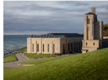
Amanda Large (BES '02, BArch '05) featured at Contact Photography Festival