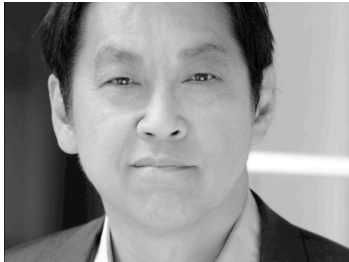
Bruce Kuwabara awarded honorary degree

Thank you to the more than 150 alumni and guests who came out to events in Vancouver , Toronto and New York City this past spring. A special thank you to our event sponsors: Yoshihara McKee Architects and Stantec Architecture, as well as all of our individual donors for their contributions to the Student Experience Fund in Architecture.