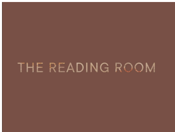
Masterworks 2024: The Reading Room by The Site Magazine