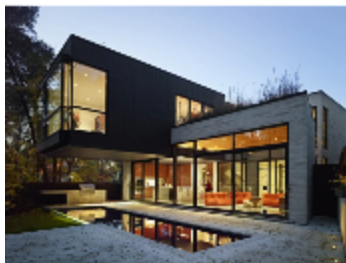
Drew Mandel (BArch '95) on Behind the Build Podcast