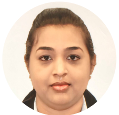
Dency David |

A key barrier in neural tissue engineering and regeneration is the low yield of mature neuronal cells from neural progenitor cells (NPCs). Biophysical cues derived from the extracellular matrix (ECM), such as topography and stiffness, and can be harnessed to design biomimetic materials for neuronal differentiation in vitro. Substrate topography and stiffness have been shown to elicit profound effects on NPC lineage commitment but have rarely been studied in combination. The optimization of numerous biophysical cues can increase neuronal yield from NPCs. Here, we use topographically enhanced polyacrylamide and N-aminoaproic acid (PAA-ACA) hydrogels with varying stiffness to evaluate the combined effect or interaction between topography and stiffness on mouse and human NPCs differentiation and rate of maturation. This works aligns with the research theme "Advanced Healthcare Platforms" as it is a novel platform that utilizes biophysical parameters to promote the regeneration and recovery of neural tissue.