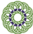
Table ronde nationale sur l'environnement et l'économie

National Round Table on the Environment and the Economy