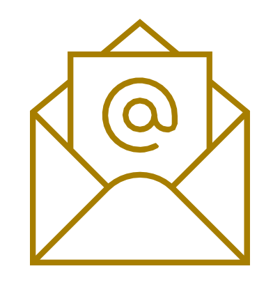
How do I ask?