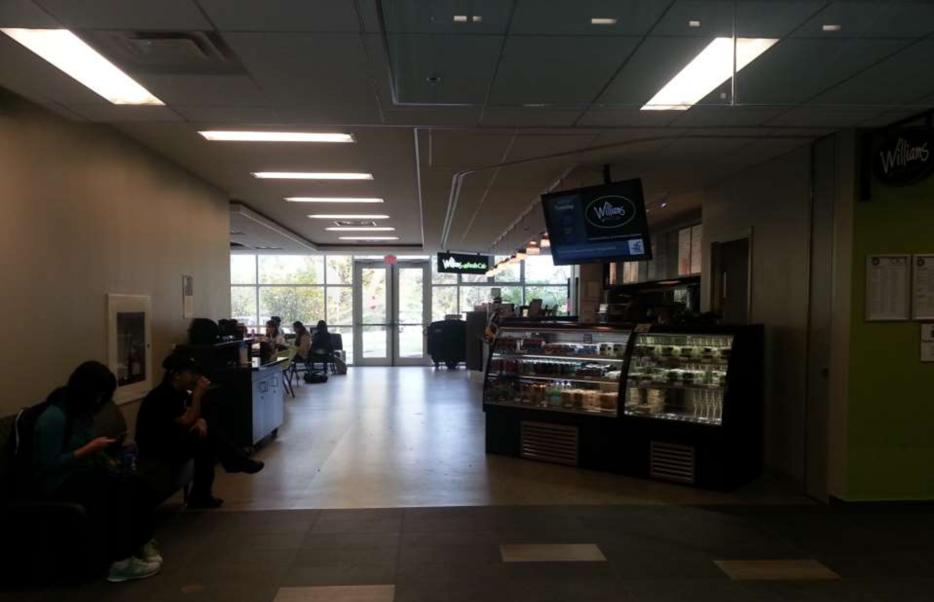
Williams Fresh Café in ENV 3 building. Coffee, tea, meals to eat here