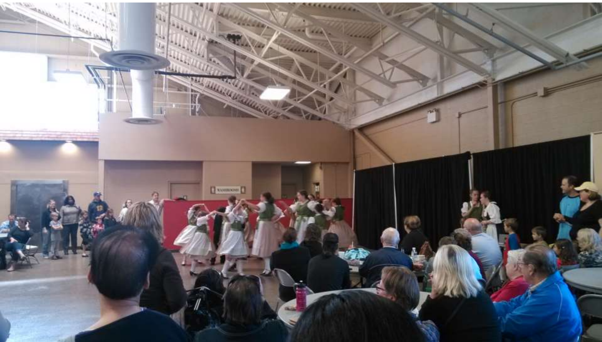
Oktoberfest dancing at the Kitchener Farmer's Market