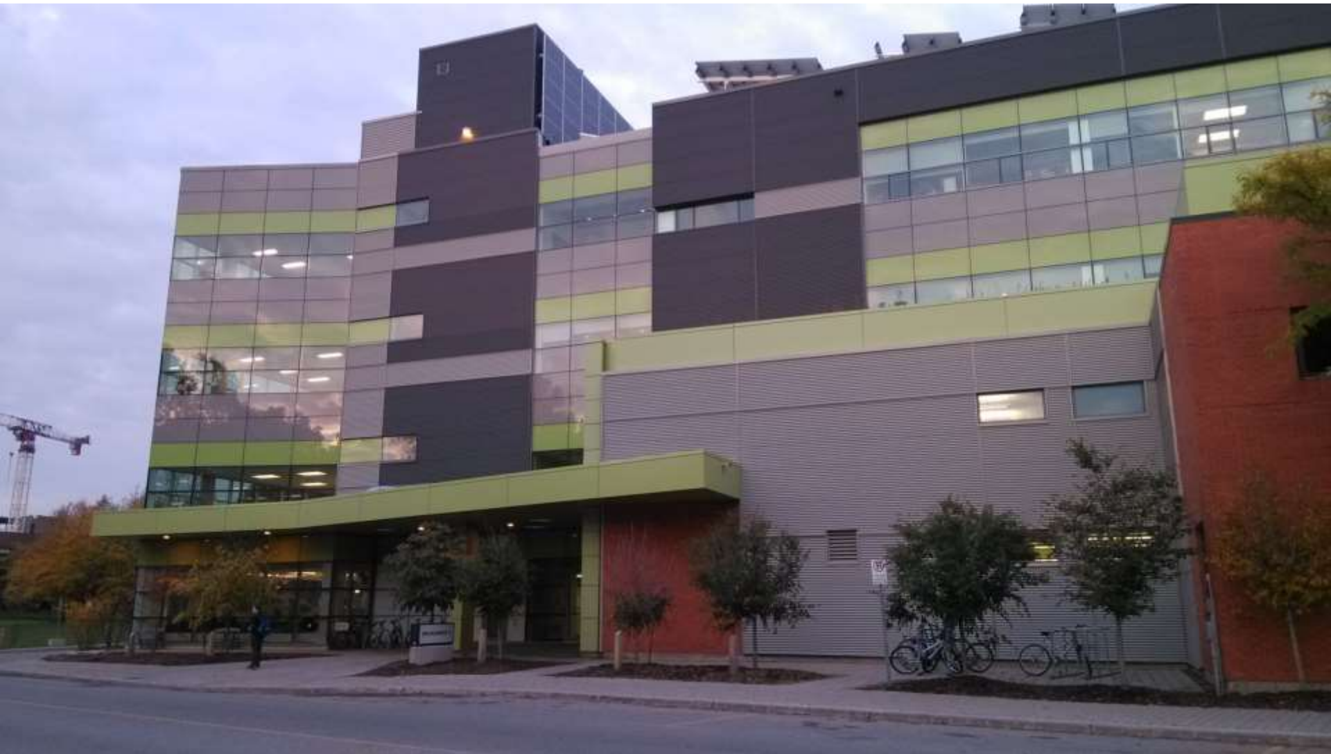
Faculty of Environment Building called “EV3”