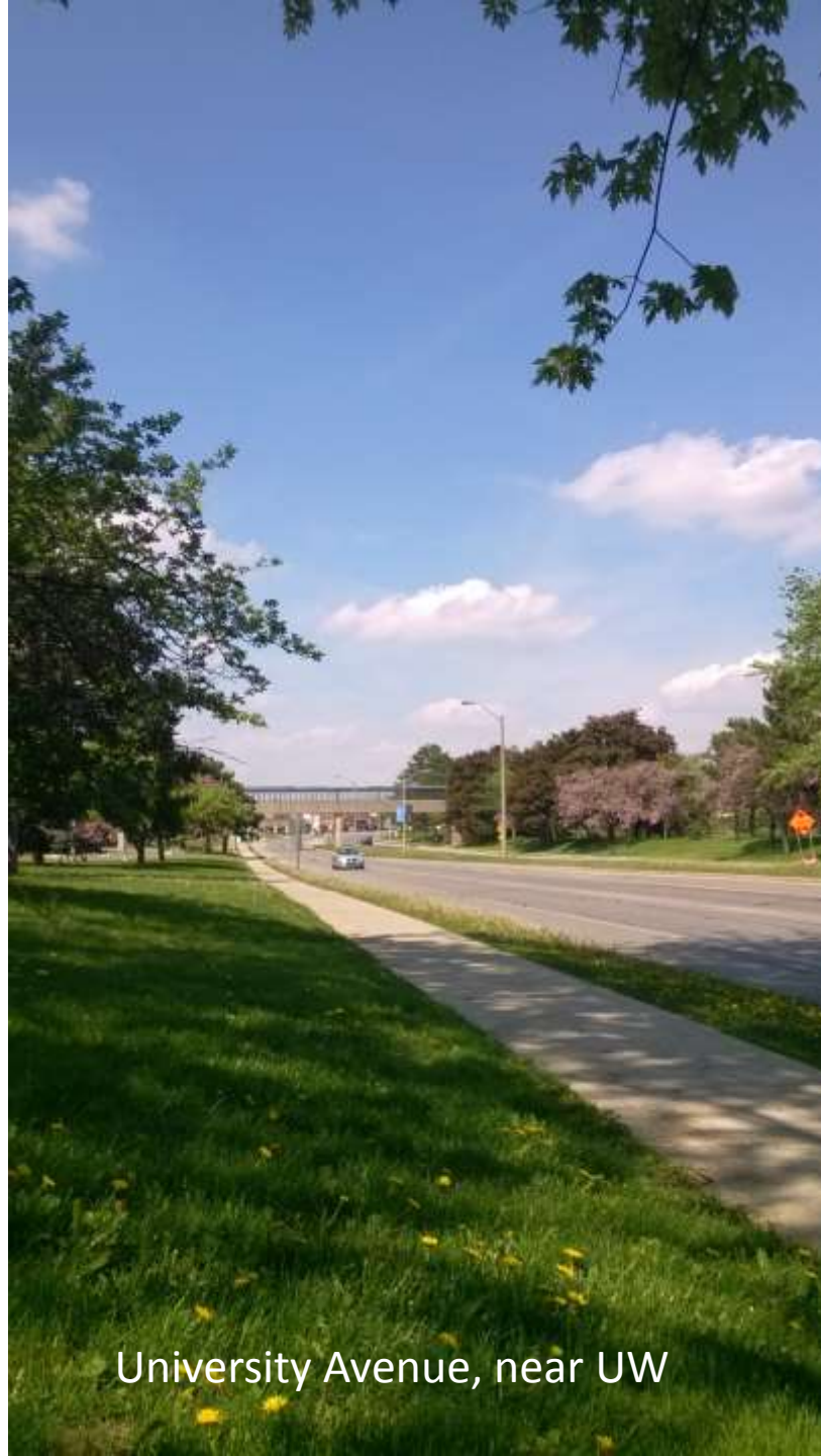
University Avenue, near UW