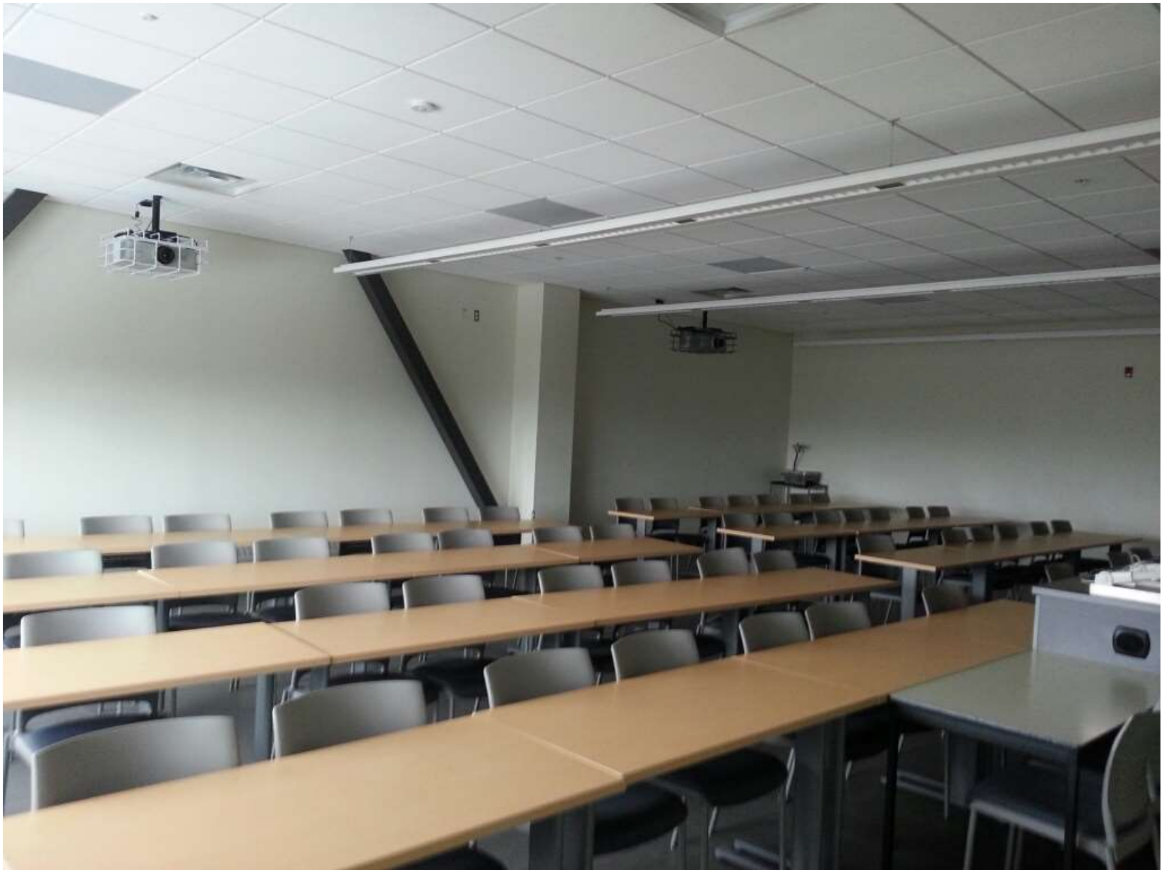
Another smaller classroom in ENV 3