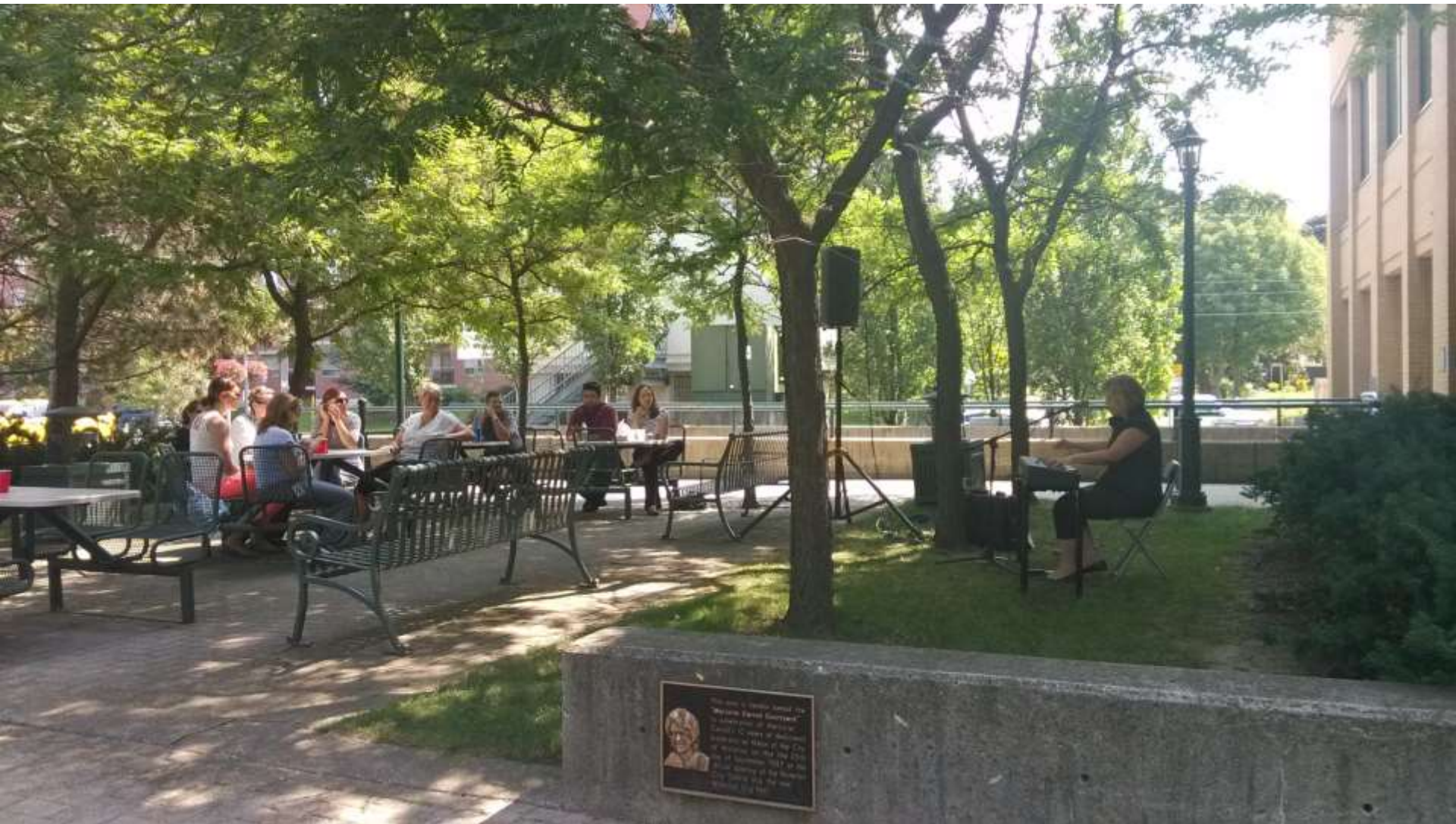
An outdoor concert on campus