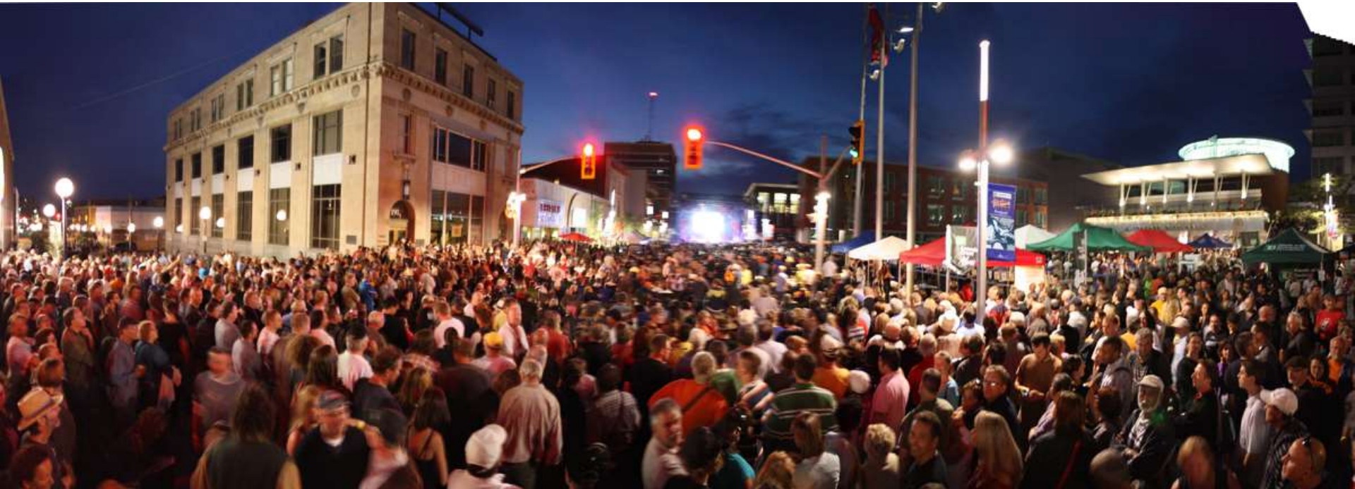
Blues fest 2014