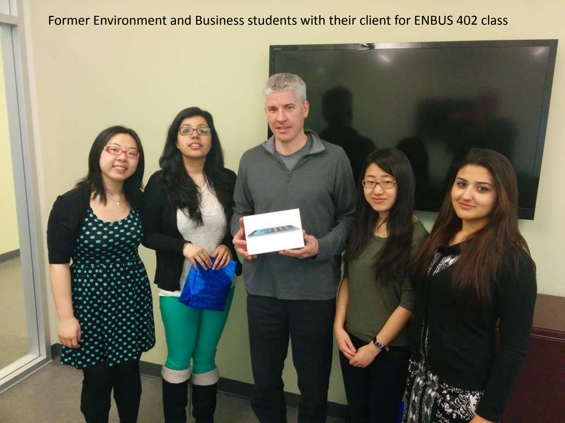
Former Environment and Business students with their client for ENBUS 402 class