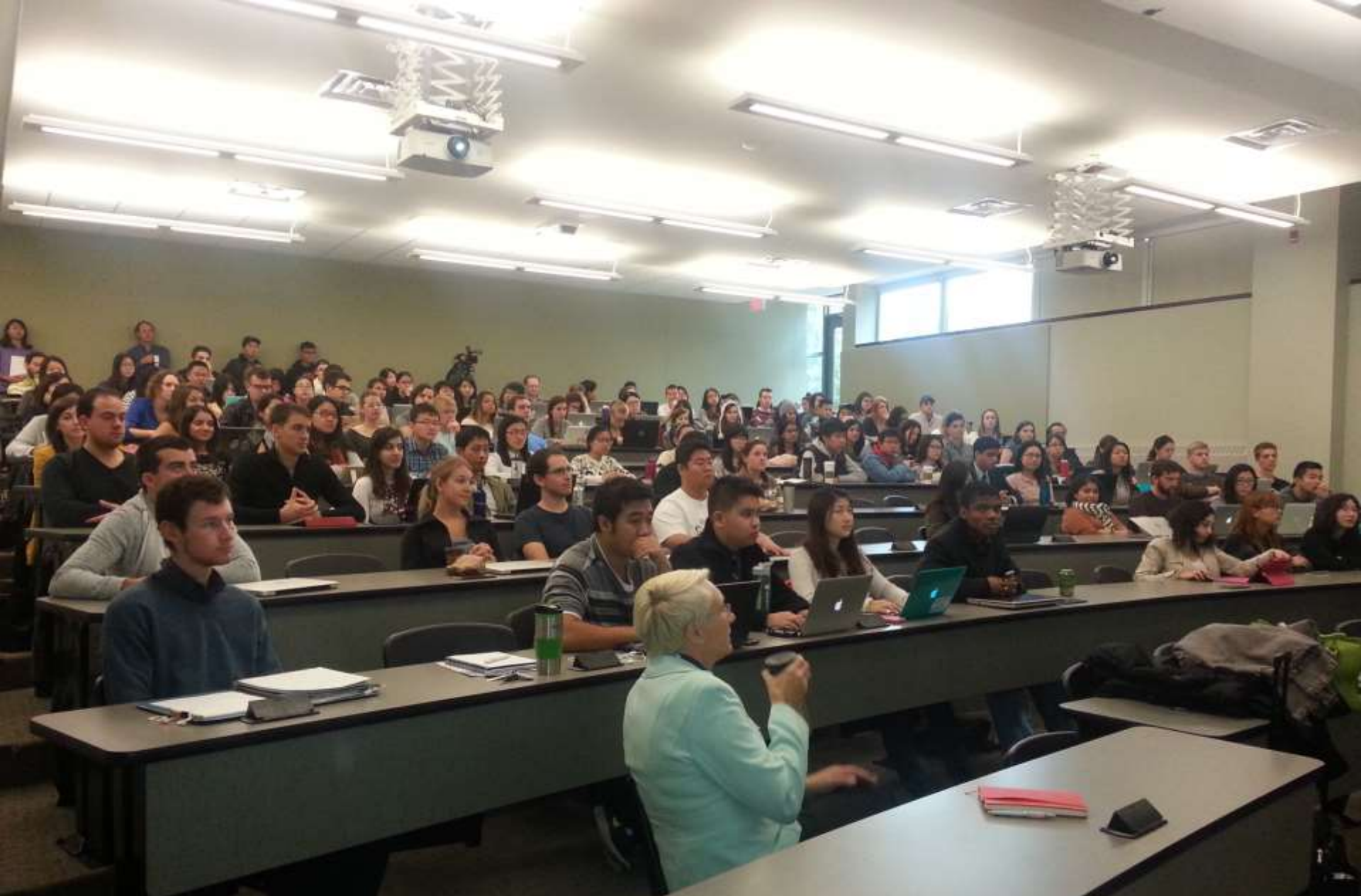
A 4 th year Environment and business class watching a guest lecture in ENV 3