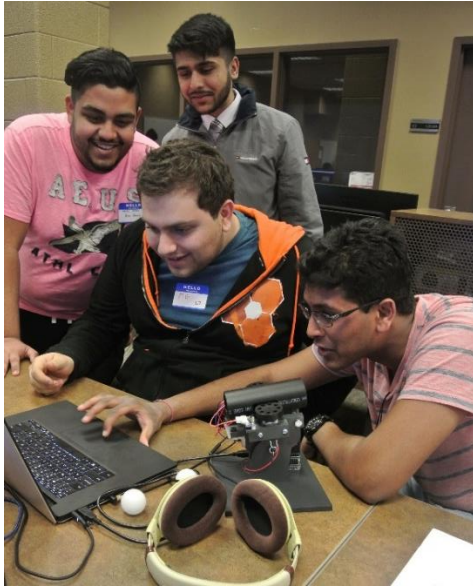
Figure 2 Students working during ECE Days, 2017

Since the first offering of Tron Days in October of 2016, the idea of an in-class, curricular hackathon has been expanded to eight different undergraduate programs (Biomedical, Civil, Computer, Electrical, Management, Mechanical, Mechatronics, and Systems Design Engineering). This model, which we have named Engineering Design Days , has been implemented in slightly different ways to engage the various cohorts of students and investigate best practices for student engagement. Each instance has had two days with no traditional classes, labs, or tutorials. Instead, the students work in teams to design and build solutions to open-ended problems. These problems are designed to integrate knowledge from across multiple courses in which the students are enrolled. As with traditional hackathons, the students' solutions were presented and tested in front of their peers at the end of the event.