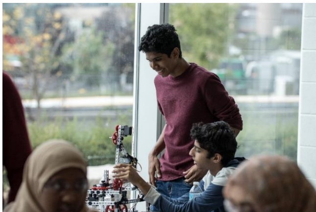
Figure 1 Students working on their robotic arm design for Tron Days, 2017