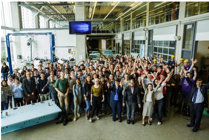
Figure 3 Participants in Civil Engineering Days with the Ideas Clinic and its supporters (Oct. 2017)

Since the first offering of Tron Days in October of 2016, the idea of an in-class, curricular hackathon has been expanded to eight different undergraduate programs (Biomedical, Civil, Computer, Electrical, Management, Mechanical, Mechatronics, and Systems Design Engineering). This model, which we have named Engineering Design Days , has been implemented in slightly different ways to engage the various cohorts of students and investigate best practices for student engagement. Each instance has had two days with no traditional classes, labs, or tutorials. Instead, the students work in teams to design and build solutions to open-ended problems. These problems are designed to integrate knowledge from across multiple courses in which the students are enrolled. As with traditional hackathons, the students' solutions were presented and tested in front of their peers at the end of the event.