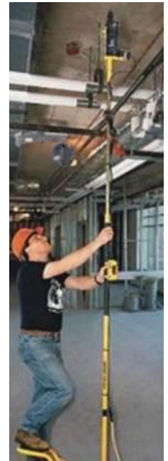
Solution: Drill jack