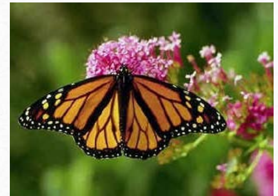
Phase 4 → 3

IAMNG Expansion WatCard, Lib, ESL, Skype, n-Fac Auth