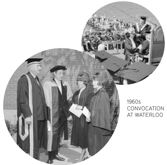
1960s CONVOCATION AT WATERLOO

Tradition underlies the proceedings of today's convocation, the continuity of this University with centuries of academic experience. Passion brings the proceedings to life, along with the enthusiasm with which the University recognizes new achievements and new ideas.