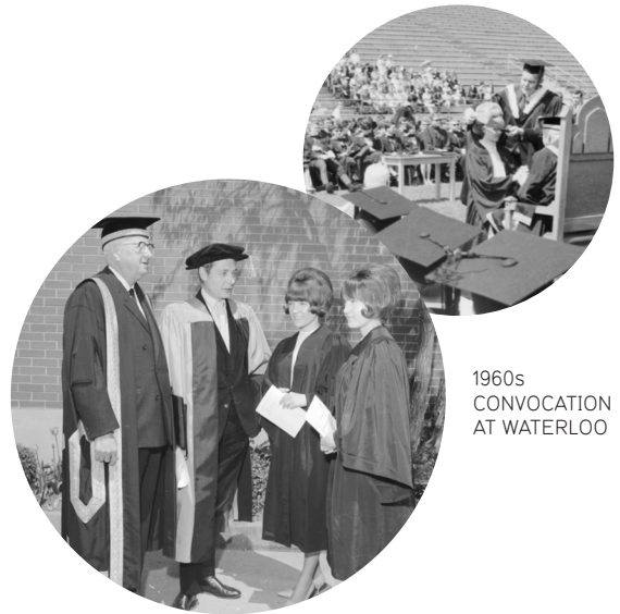
1960s CONVOCATION AT WATERLOO

Tradition underlies the proceedings of today's convocation, the continuity of this University with centuries of academic experience. Passion brings the proceedings to life, along with the enthusiasm with which the University recognizes new achievements and new ideas.