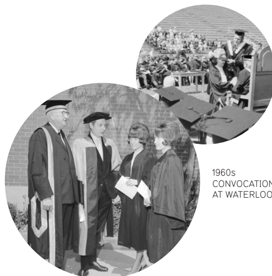
1960s CONVOCATION AT WATERLOO

Tradition underlies the proceedings of today's convocation, the continuity of this University with centuries of academic experience. Passion brings the proceedings to life, along with the enthusiasm with which the University recognizes new achievements and new ideas.