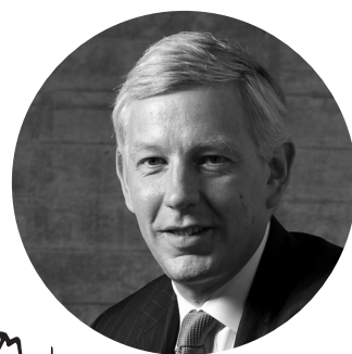
DOMINIC BARTON Chancellor

“THE UNIVERSITY OF WATERLOO HAS A TRADITION OF DEVELOPING TALENT FOR A COMPLEX FUTURE, AND YOU ARE NO EXCEPTION.”