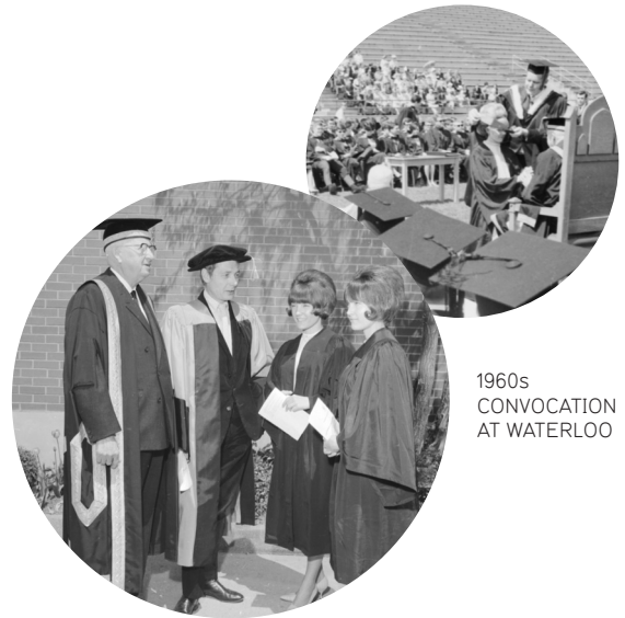
1960s CONVOCATION AT WATERLOO

Tradition underlies the proceedings of today's convocation, the continuity of this University with centuries of academic experience. Passion brings the proceedings to life, along with the enthusiasm with which the University recognizes new achievements and new ideas.