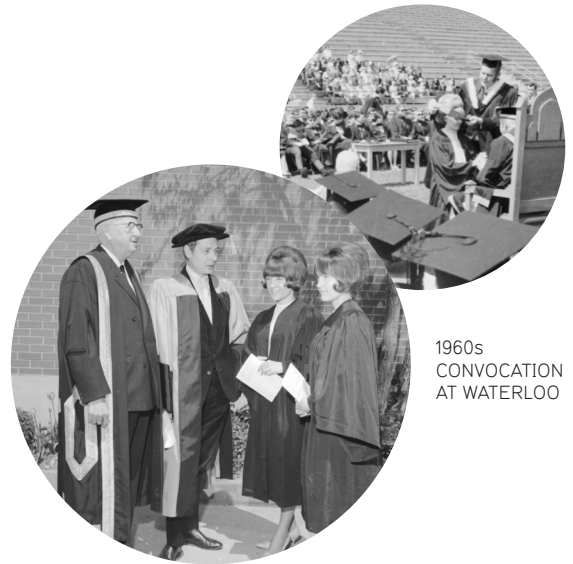
1960s CONVOCATION AT WATERLOO

Tradition underlies the proceedings of today's convocation, the continuity of this University with centuries of academic experience. Passion brings the proceedings to life, along with the enthusiasm with which the University recognizes new achievements and new ideas.