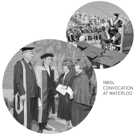
1960s CONVOCATION AT WATERLOO

Tradition underlies the proceedings of today's convocation, the continuity of this University with centuries of academic experience. Passion brings the proceedings to life, along with the enthusiasm with which the University recognizes new achievements and new ideas.