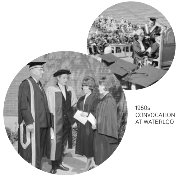
1960s CONVOCATION AT WATERLOO

Tradition underlies the proceedings of today's convocation, the continuity of this University with centuries of academic experience. Passion brings the proceedings to life, along with the enthusiasm with which the University recognizes new achievements and new ideas.