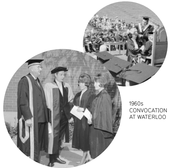
1960s CONVOCATION AT WATERLOO

Tradition underlies the proceedings of today's convocation, the continuity of this University with centuries of academic experience. Passion brings the proceedings to life, along with the enthusiasm with which the University recognizes new achievements and new ideas.