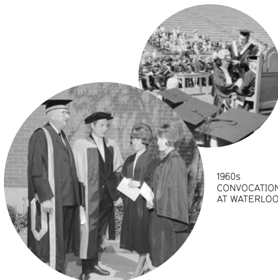
1960s CONVOCATION AT WATERLOO

Tradition underlies the proceedings of today's convocation, the continuity of this University with centuries of academic experience. Passion brings the proceedings to life, along with the enthusiasm with which the University recognizes new achievements and new ideas.