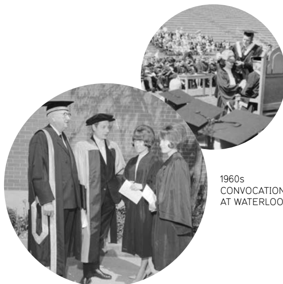
1960s CONVOCATION AT WATERLOO

Tradition underlies the proceedings of today's convocation, the continuity of this University with centuries of academic experience. Passion brings the proceedings to life, along with the enthusiasm with which the University recognizes new achievements and new ideas.