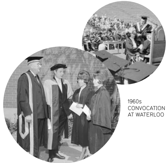
1960s CONVOCATION AT WATERLOO

Tradition underlies the proceedings of today's convocation, the continuity of this University with centuries of academic experience. Passion brings the proceedings to life, along with the enthusiasm with which the University recognizes new achievements and new ideas.