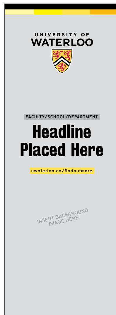
Banner Layout 3

The University of Waterloo logo is located at the bottom and content is located in the middle.