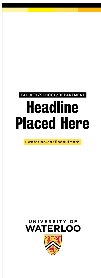
Banner Layout 2

The University of Waterloo logo is located at the bottom and content is located at the top.