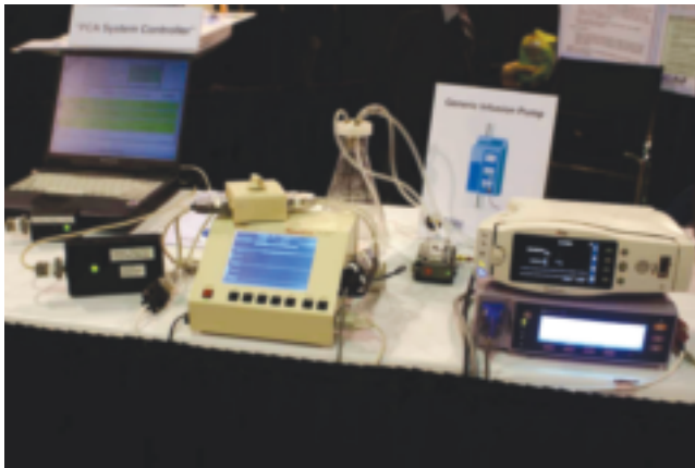
Figure 2. Case study setup.

dose to all treatment devices at a frequency of 1Hz. The PCA pump is a treatment device and it keeps on delivering treatment only as long as it periodically receives a go signal from the supervisor.