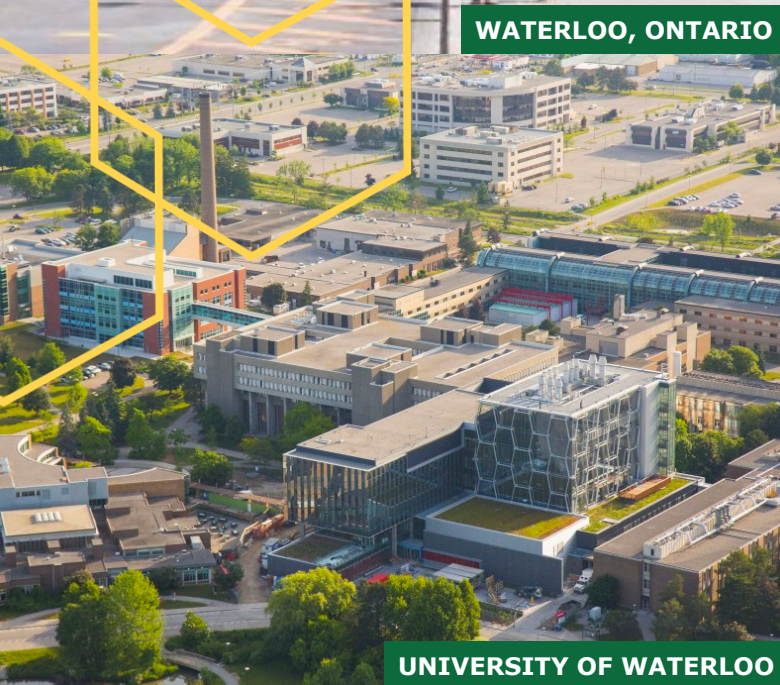
UNIVERSITY OF WATERLOO