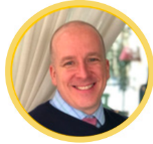
Grant Program information