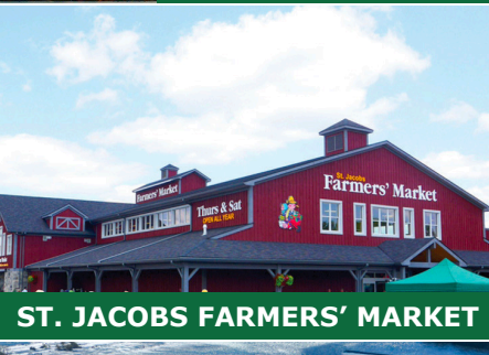
ST. JACOBS FARMERS' MARKET