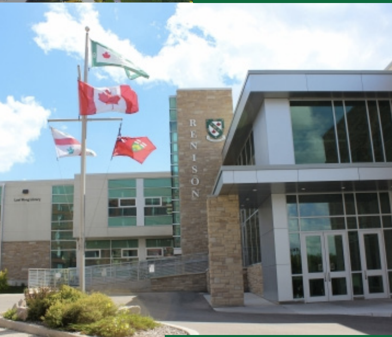
RENISON UNIVERSITY COLLEGE