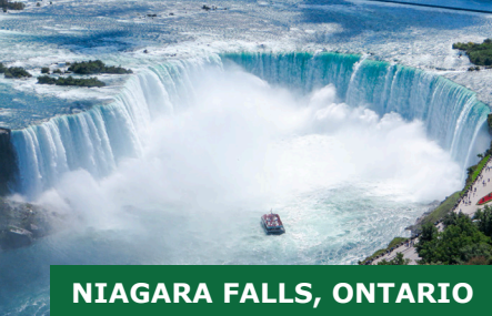
NIAGARA FALLS, ONTARIO