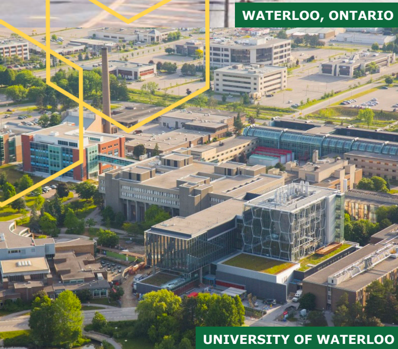
UNIVERSITY OF WATERLOO