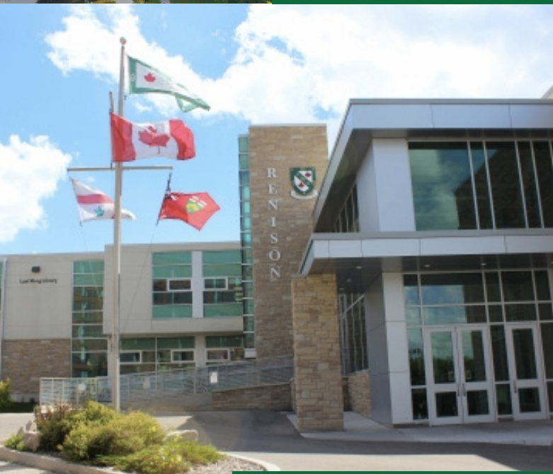
RENISON UNIVERSITY COLLEGE