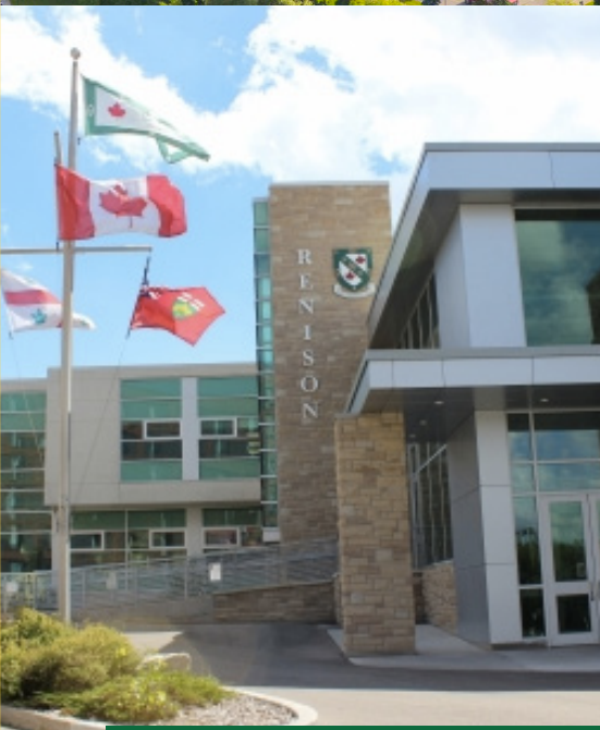
RENISON UNIVERSITY COLLEGE