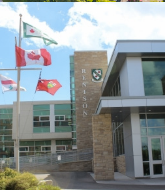
RENISON UNIVERSITY COLLEGE