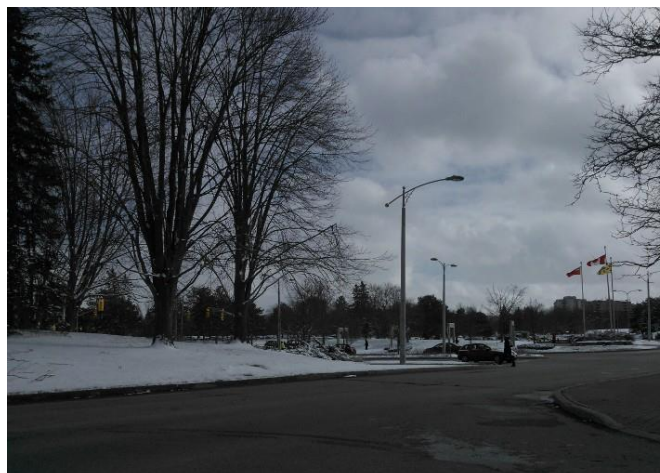
Image of April 15 th storm in Waterloo, Ontario