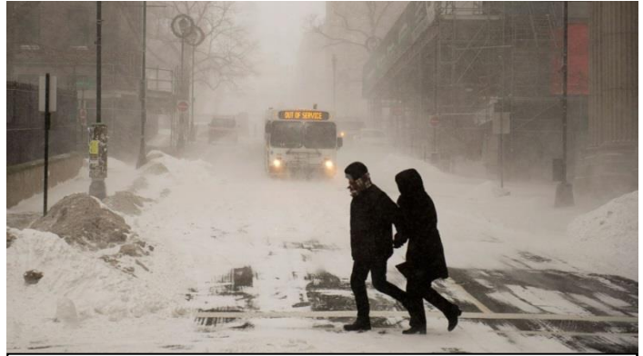
Blizzard in Halifax on January 3 rd , 2014

Nova Scotia has also had its fair share of severe winter weather. While the province is accustomed to winter storms, the event at the beginning of January proved to be especially treacherous. Businesses and schools were closed, city bus services were cancelled and police vehicles were pulled from the roads due to the dangerous conditions. Road service crews operating approximately 200 plows fought an uphill battle as the high winds drifted the 40 plus centimeters snowfall back onto highways and roads.