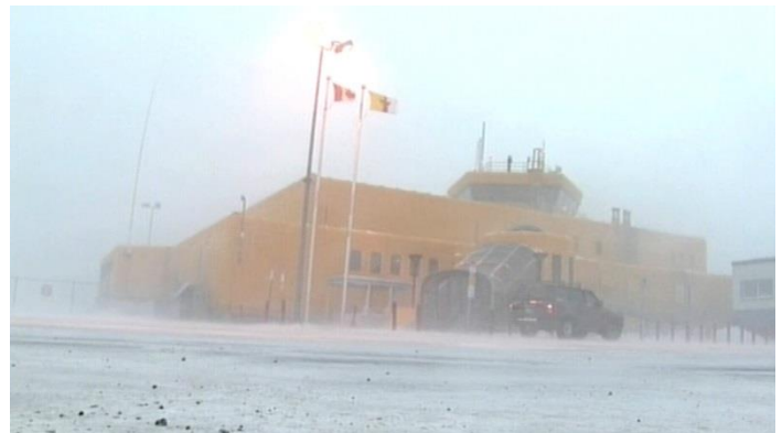
Aftermath of the Iqaluit Blizzard, January 7 th , 2014

Northern Canada was not spared either this winter, as a blizzard hit Iqaluit at the beginning of January. The worst storm to affect the region since 2007, wind speeds exceeded 140km/h, equivalent in strength to a Category 1 hurricane. Business and schools were shut down the afternoon before the storm hit, and while some areas experienced building damage and were without power for up to 16 hours, everything resumed the next afternoon when the weather warning had ended. Fortunately, the number of injuries was also minimal. The next step was to begin cleanup and repairs, a difficult task given that supplies have to be ordered and then shipped to Iqaluit.