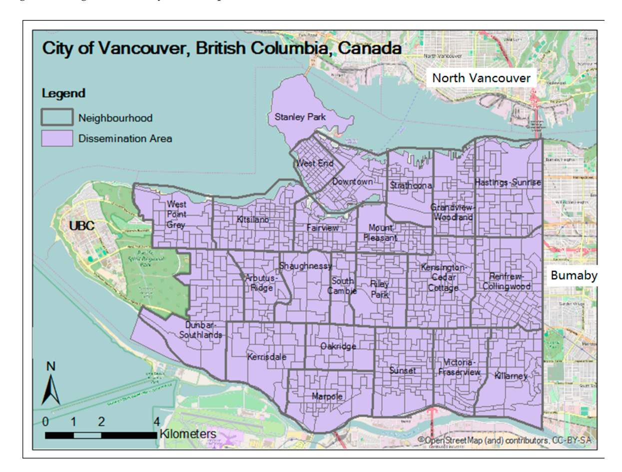
Figure 1. Study area divided into dissemination areas: City of Vancouver, British Columbia.

Figure 1 shows the study area and the local neighborhood boundaries. The city is divided into dissemination areas (DA). DA is the smallest standard geographic unit, usually with a population of 400 to 700 persons (Canadian Census Program). As of 2011, the City of Vancouver has 995 DAs, which give the regression analysis a sample size of N = 995.