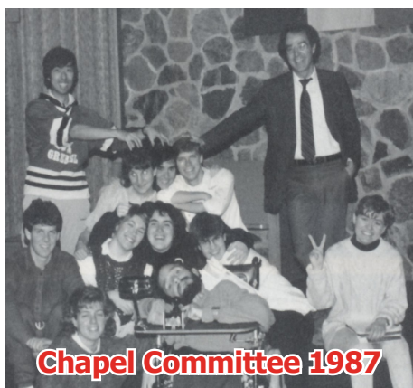
Chapel Committee 1987

Watch for your registration form in UW's homecoming mailing this summer! Registration will also be available online.