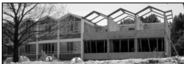
The extension to the residence building has room for 26 more students.

I remember the broad and generous support of the constituency. Grebel is the College of Mennonite Church Eastern Canada. Many people have expressed their genuine interest in and support for the College in a variety of ways throughout the past year. Financial support reached new levels despite the economic challenges facing many donors. With that encouragement and support, Grebel will continue to thrive as it enters its fifth decade.