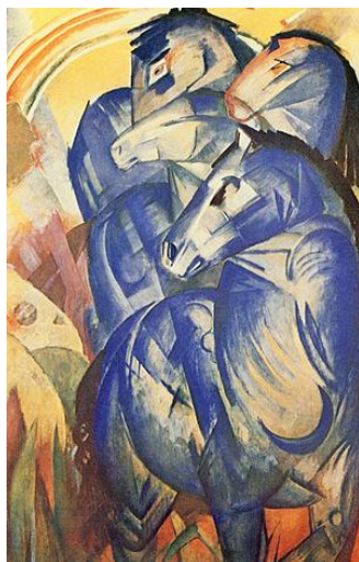
Franz Marc, "Tower of Blue Horses" (1913 – now missing)