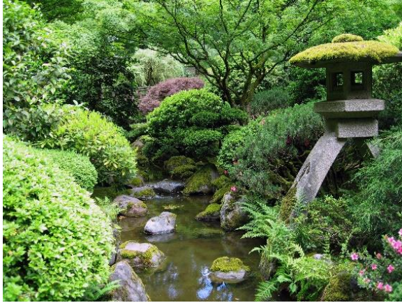
Japanese Garden, Portland, Oregon