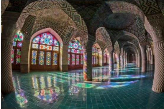
Nasir-ol-Molk Mosque, Shiraz, Iran

The Arts: Music, Dance, Architecture, Film