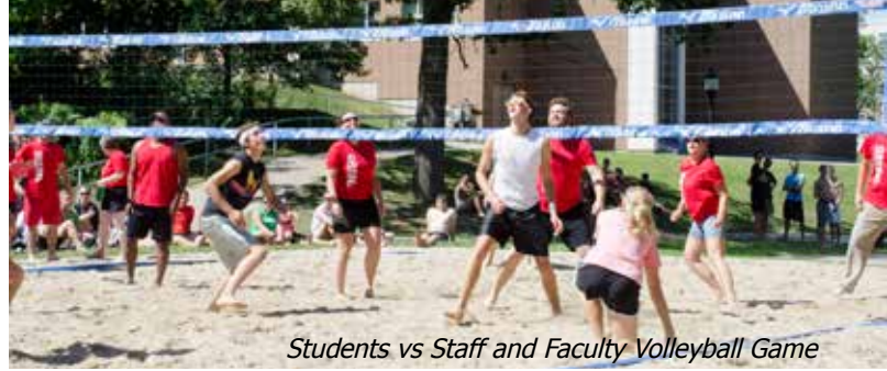
Students vs Staff and Faculty Volleyball Game

Huxman continued, "this summer Grebel residents and staff made a quilt. Collecting and stitching quilt blocks signals something very important to Grebel's vitality: community building, creativity, generosity, compassionate service, creation care, and even global engagement. These are our core values. So quilt blocks are important too—especially if we want to imagine and create strength in diversity."