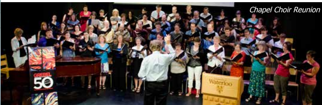
Chapel Choir Reunion