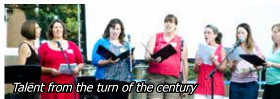
Talent from the turn of the century