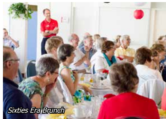
Sixties Era Brunch