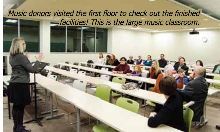
Music donors visited the first floor to check out the finished facilities! This is the large music classroom.