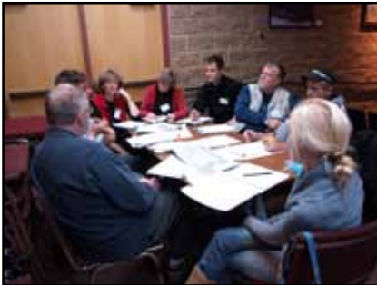
Goderich CHL Workshop, October 2009

The Historic Places Initiative team participated in many community events throughout 2009.