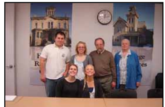
HRC Team, April 2009

Over the course of the past year the team has exceeded their target nominations, trained young heritage workers, engaged local municipalities