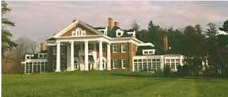
Landon Hall http://www.langdonhall.ca/