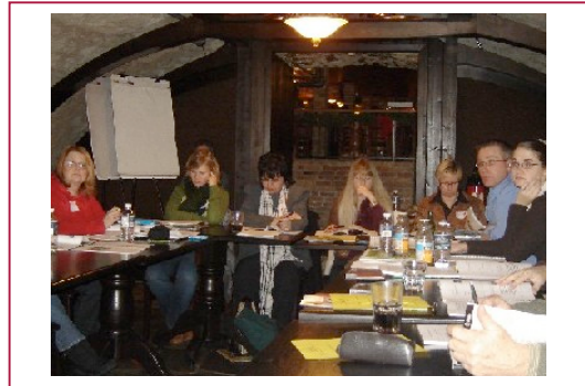
Heritage Conservation Workshop, Huether Hotel, December, 2007

After almost a year of nominating properties to the Canadian Register of Historic Places, the team found that they were being approached with similar questions and concerns from many contacts within their 16 partner municipalities. As a means to address these concerns and explain the next steps a municipality could take after having nominations submitted to the Canadian Register, a Heritage Conservation Workshop was organized.