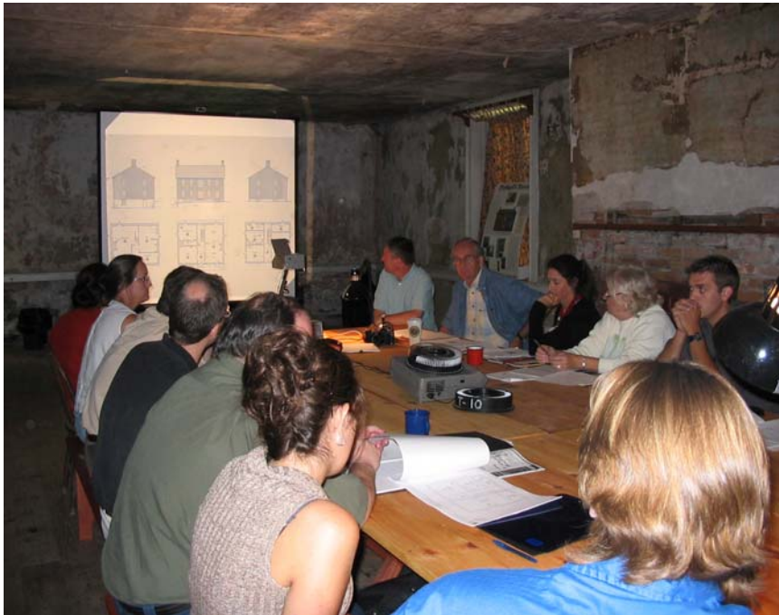
Attendees at the heritage conservation workshop in the Fryfogel Inn near Stratford.