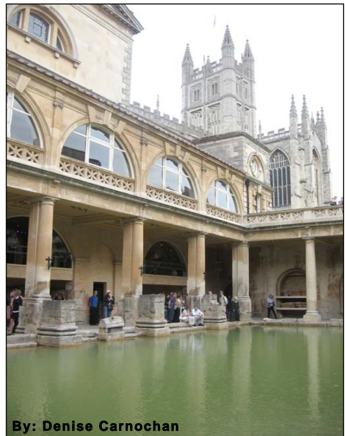
By: Denise Carnochan

Heritage Resources Centre University of Waterloo www.env.uwaterloo.ca/ research/hrc 519-888-4567 ext. 36921