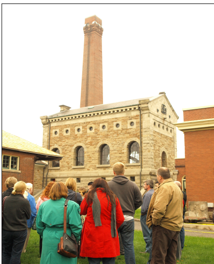
Attendees at the Heritage Planning Workshop in Hamilton, ON at the Steam & Technology Museum, October 2010.

Each year, interested citizens, planners and students from other universities are able to attend the HRC's Heritage Planning Workshop that is held in various locations across the Province, making it accessible to a broader spectrum of the population. In the last five years the workshop has been held in: Windsor, Brighton, Mississauga, Goderich and Hamilton. It not only provides interested members of the public and planning professionals a chance to improve their knowledge, but also exposes students to people with first-hand experience in heritage planning at the grass roots level. The popularity of this workshop has been steadily increasing over the years, with our last workshop held over two weekends in the fall of 2010 at the Steam and Technology Museum in Hamilton attracting 28 participants.