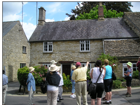
Participants of the Cotswolds study trip to the UK enjoying the local architecture, June 2010.