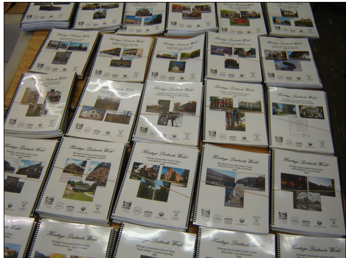
Completed HCD Study reports, 2009.

districts in Ontario do work. The results of this study are found in 26 individual reports and a summary report. The findings have been celebrated and widely promoted in many venues across the province and internationally as the study results are slated to be published in the international journal, Urban Affairs Review , in the summer of 2011. Study has also been reported in the Globe and Mail , the Record and the Heritage Canada Foundation's magazine. The success of Phase I of this study has resulted in continued funding for the HRC from the Ontario Trillium Foundation. Phase II will begin in April 2011.