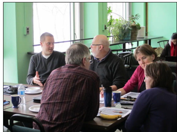
Attendees of the Heritage Conservation District Workshop participating in a case study of the local McGregor/Albert Heritage Conservation District in Waterloo, ON, March 2011.