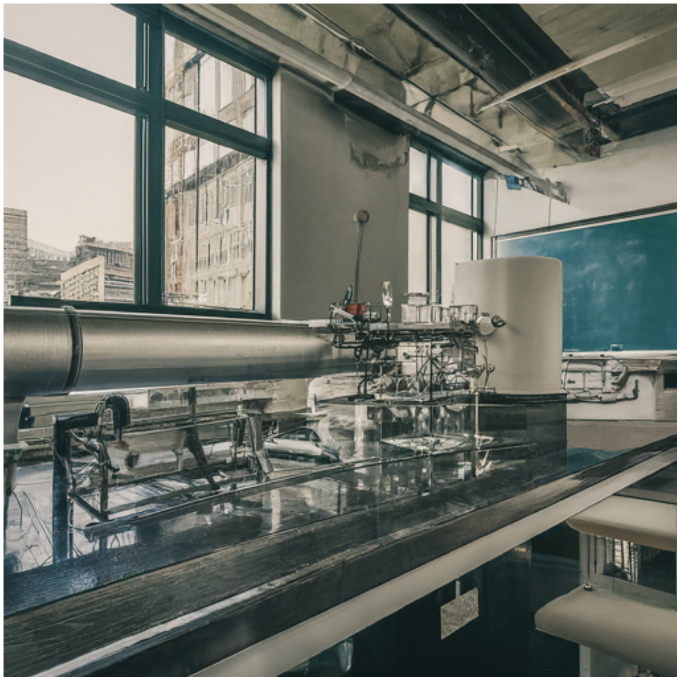
Figure 2. The fluid mechanics laboratory.