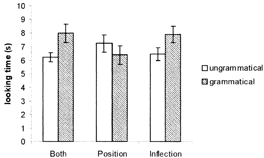
FIGURE 1 Mean looking time to grammatical and ungrammatical passages in Experiment 1. Error bars reflect standard error.

t(17) = 2.45, p < .05, d = .72 , indicating that 16-month-olds can detect when the sentential positions of familiar nouns and verbs are interchanged and inflectional cues indicate a mismatch. However, in the content word position condition, infants did not show a significant difference in their listening preference, t(17) = 1.18, p > .25, d = 0.25 , listening to the grammatical passages for an average of 6.4 sec and the ungrammatical passages for 7.2 sec. This suggests that word order alone was not enough to cue the infants to the ungrammaticality. In the inflection condition, infants again showed a preference for the grammatical passages (7.9 sec) over the ungrammatical passages (6.4 sec), although this difference was only marginally significant, t(17) = 1.90, p = .07, d = 0.49 . Overall, the pattern of results across the ANOVAs and individual t tests suggests that infants are sensitive to the appropriate placement of verbal -s inflection on highly familiar nouns and verbs, but not the word order of these same content words. Infants had a significant preference for the grammatical passages in the both condition and a marginal preference for the grammatical passages in the inflection condition; moreover, the ANOVA comparing these two conditions found only a main effect of grammaticality and no interaction. The reverse pattern of results was found when these two conditions were compared with the content word order condition.