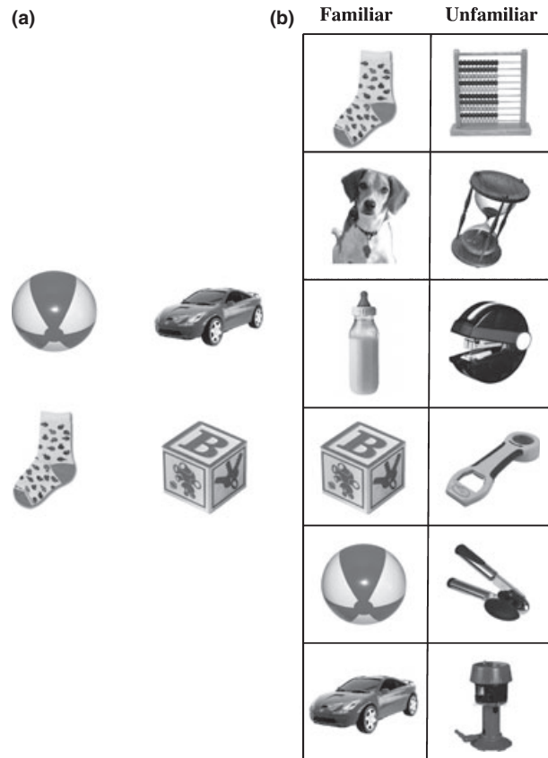
Figure 1 (a) Sample exposure stimuli, (b) test stimulus pairs. Actual stimuli were in color.

Results from the parental questionnaire indicated that the items we selected were appropriate for this sample of toddlers. On a scale of 1 (not visually familiar, label unknown), 2 (visually familiar, label unknown), 3 (visually familiar, label familiar), and 4 (visually familiar, label highly familiar), items used as familiar words received an average score of 3.73 ( SD = .22 ) for toddlers assigned to the Control group and 3.76 ( SD = .3 ) for toddlers assigned to the Accent group, indicating that they were very familiar to both groups of toddlers. Parents