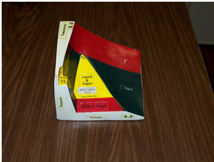
Figure 1: Placeholder. Photo of a PVT surface.

Figures must be referenced in the text, and placed in the first convenient place after they are first referenced (see Figure 1). Per at simul perpetua. Dolorem aliquando ius te, pro at lorem option ceteros, ius idque ullamcorper ea. Ne nisl novum contentiones nec, ei brute augue rationibus vim. Elit dicit intellegat et eam. Prius justo omnium invidunt ei.