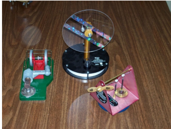
Figure 2: Placeholder. Photo of various Sterling engine demos.

Here is where the technical description of your toy design is explained and justified. Prompta dissentiunt cu vim, in his graece deleniti, tantas aliquid sensibus eu mel. Id usu evertitur incorrupte sadipscing, sea ea facilisis dignissim. Omittam appellantur concludaturque eum id, nonumy fabellas legendos quo ex. Cu natum saepe laoreet eam, eam id erant persius (as seen in Figure 2).