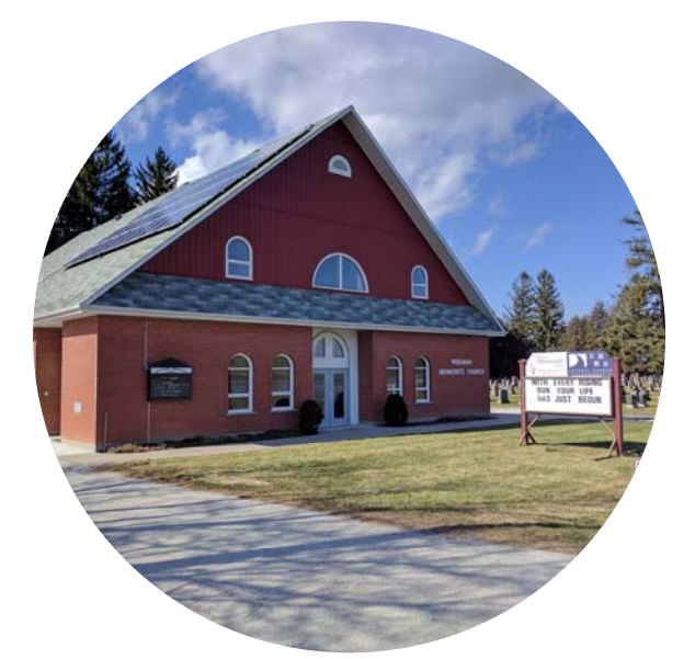
Wideman Mennonite Church, Markham