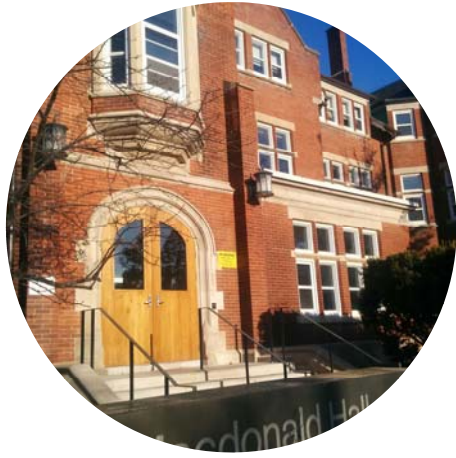
Macdonald Hall, Guelph