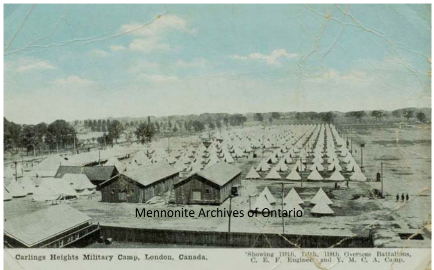
Carlings Heights Military Camp, London, Canada.

Carling Heights Military Camp, London, Ontario. Before the creation of Camp Borden in 1916, there were 16,000 men in training at Carling Heights.