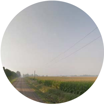
6566981 15 th Line, East Zorra Township