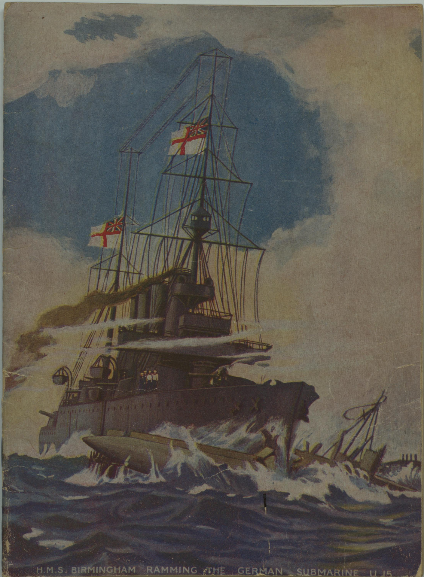
H.M.S. BIRMINGHAM RAMMING THE GERMAN SUBMARINE U 15