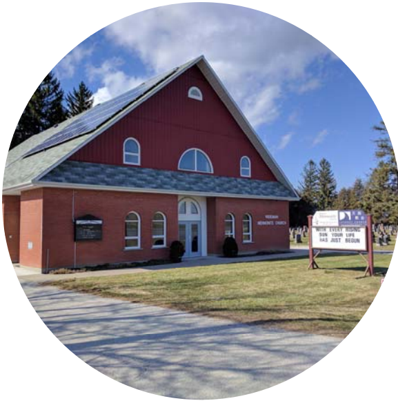
Wideman Mennonite Church, Markham