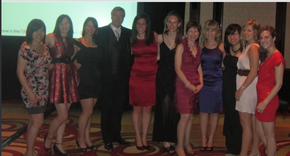
2011 Centennial Award Winners pictured with members of the CPhA Board of Directors