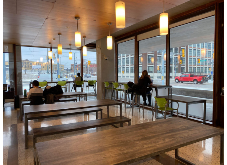
An inside look into the reopening of The Dispensary with 24/7 self-serve beverages & food.

In addition, SOPhS Athletics organized intramural sports for our cohorts which saw Pharmacy students participating in soccer, volleyball, ultimate frisbee and basketball intramurals. SOPhS Social organized spirit wear for our cohorts which saw some fresh new items for our students.