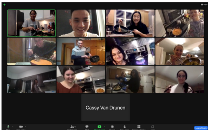
Screenshot taken of the Cooking Class held on Hobbies Night during Phrosh 2022.

There was also a Phamily Pheud Trivia Night inspired by the famous game show of the same name (but evidently different spelling), which saw each Phrosh teams split in half to compete to win gift cards. Congratulations to Phrosh teams, Earthromycin and Shooting Solostars, for winning Phamily Pheud Trivia Night! Finally, the last day of Phrosh week was dedicated to wrapping up a week-long event that was an online Scavenger Hunt in which teams were competing against one another and against the clock. It was a close race, but congratulations to Marsvelon for winning this year's Phrosh Scavenger Hunt!