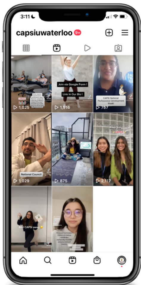
Screenshot of CAPSI Awareness Week TikToks, created by CAPSI council. Check out @capsiuwaterloo for more!

You can watch our take on TikTok trends on the CAPSI Instagram page!