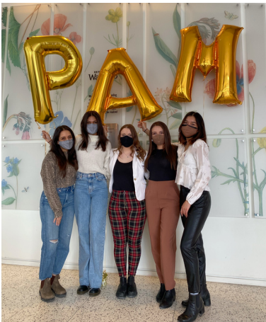
Photos taken at the PAM Kick-Off Breakfast on March 1, 2022.