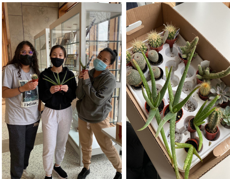
CAPSI members with their succulent purchases.

Early February we had a Mystery Succulent Sale, the first since before the pandemic, and sold 20 plants total! CAPSI members could order a succulent and pick it up from the School, with lots of variety to choose from. Just another perk of being a CAPSI member ;)