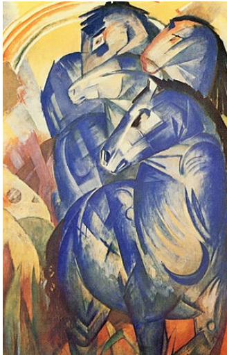
Franz Marc, "Tower of Blue Horses" (1913 – now missing)