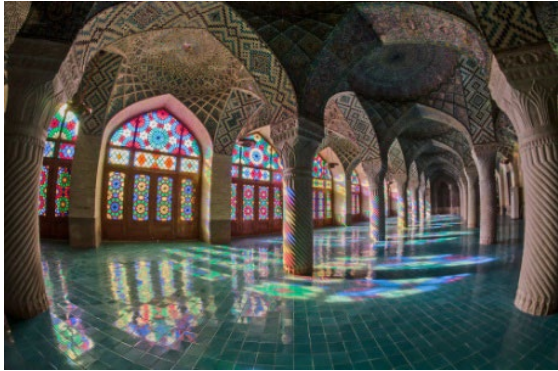
Nasir-ol-Molk Mosque, Shiraz, Iran

The Arts: Music, Dance, Architecture, Film