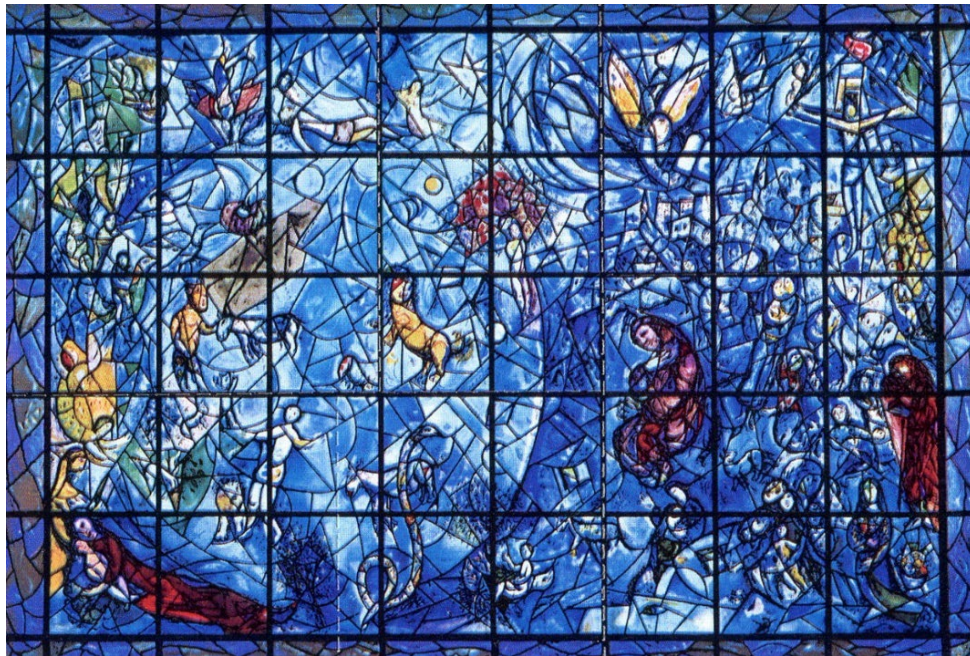
Marc Chagall, Peace Window , UN, 1967