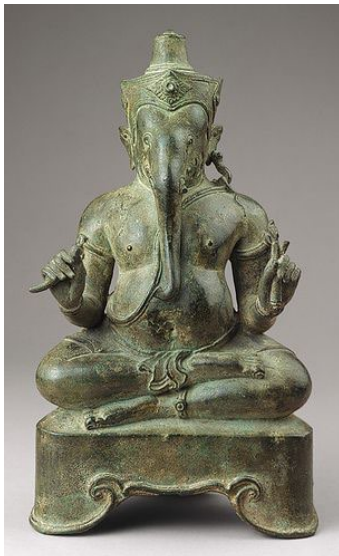
Seated Ganesh, 15 th century, Thailand