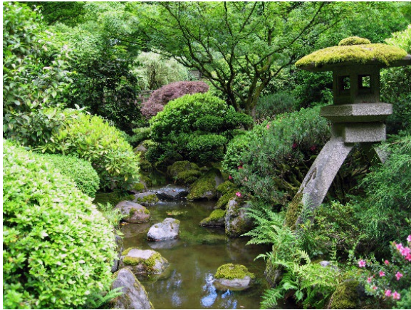
Japanese Garden, Portland, Oregon