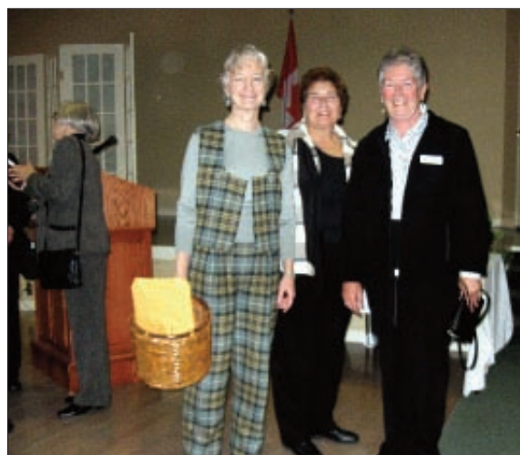
Would the caption "When shall we three meet again?" have provoked some "Thunder, Lightning, and Rain?" – Phil